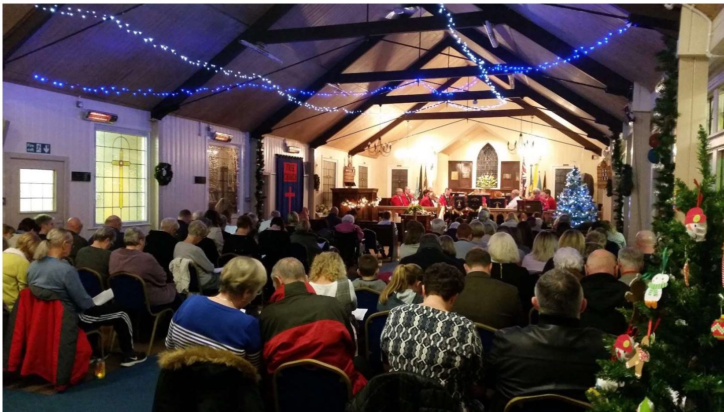
Our brass band Carol Service is always popular!

Numerically, we have a congregation in the mid-twenties for most services, with the exception of Church Parade where around seventy people attend. Both of these numbers have declined in recent times, particularly Church Parade attendance post-pandemic. We also lost a number of faithful congregants in recent years. We are now seeking to prayerfully grow our congregation.