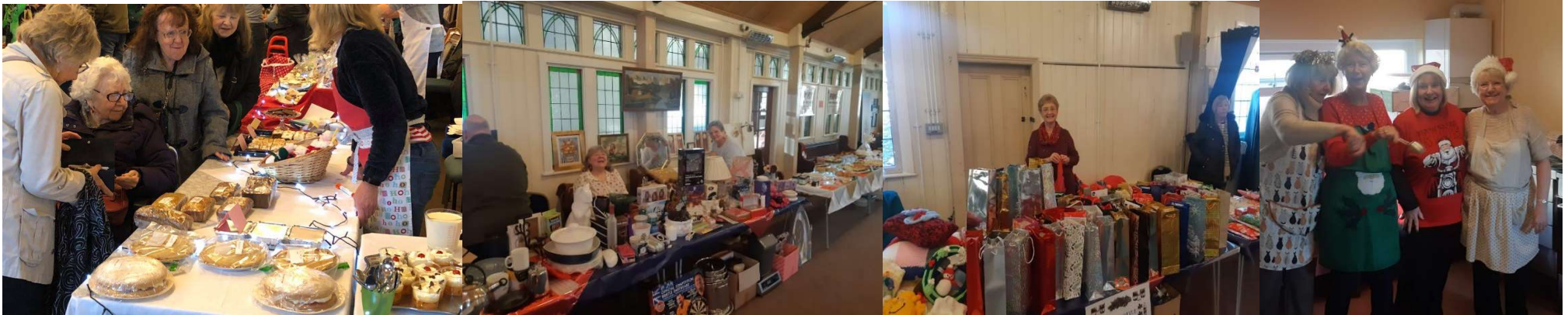
Raising money for the work of St. George's at the November Sale