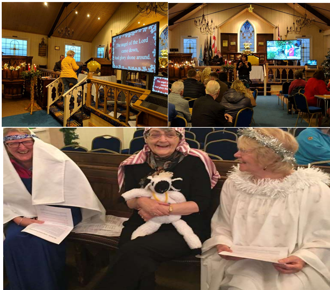
Fun at the Crib Service