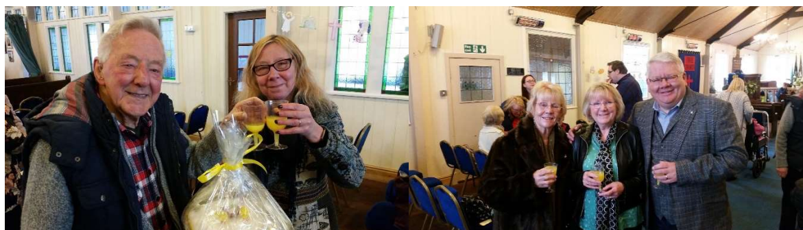
Raising a glass on Easter Day!