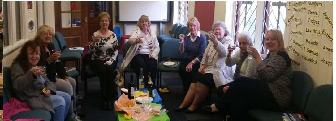
The Book Club