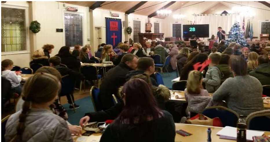
Christmas Chocolate Bingo